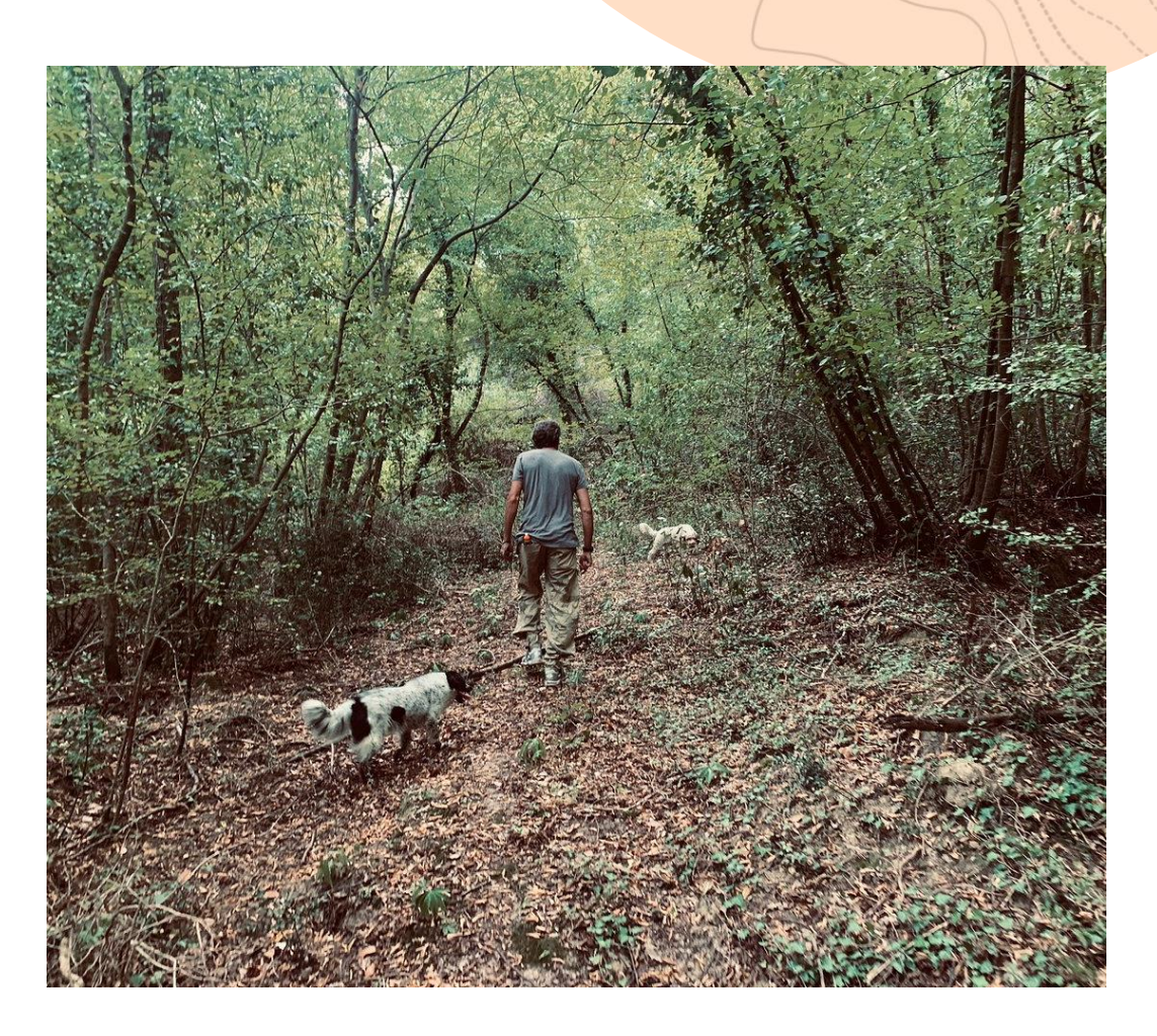
Tartufi Nacci Via Zara, 110, 56028 San Miniato