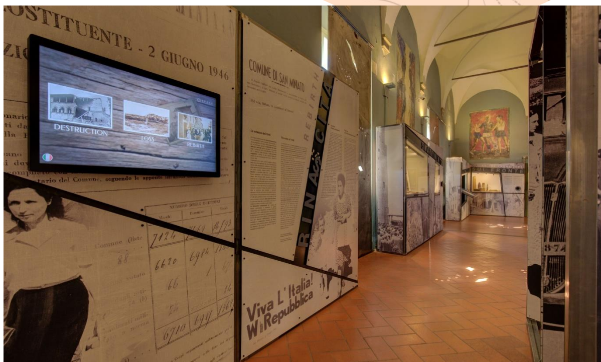
MuMe Museo della Memoria Loggiati S. Domenico, 8, 56028 San Miniato